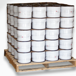
500 ft reel