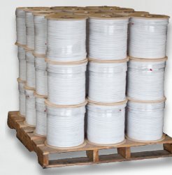
1000 ft reel