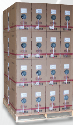
1000 ft box