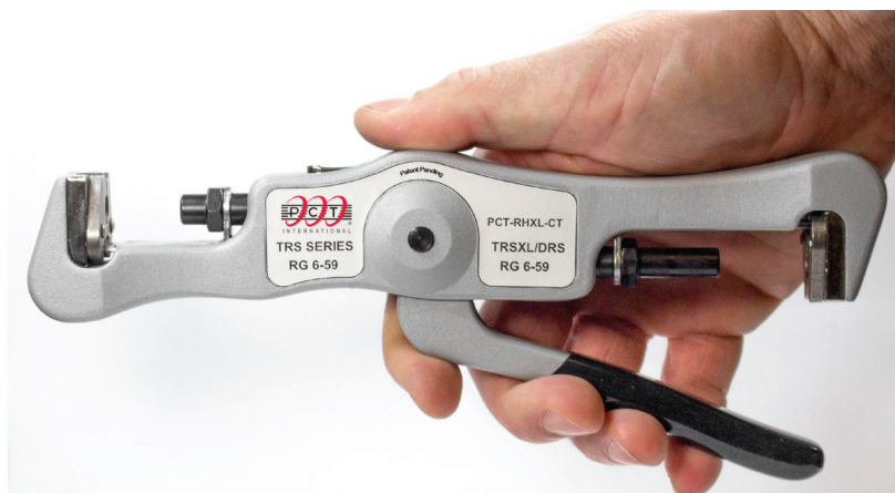
Compressing PCT-TRSXL-6L or PCT-TRSXL-6LMG Connectors

Call +1.800.306.8948 for more information